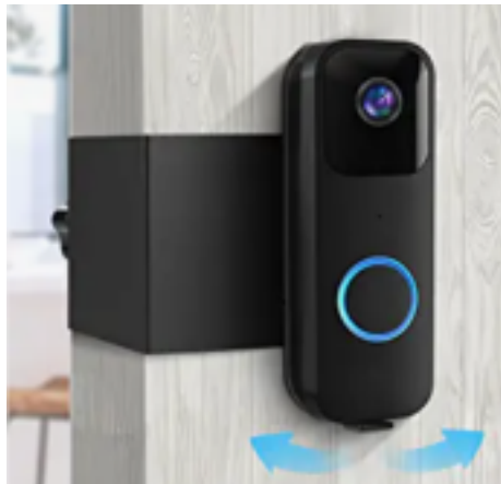
Doorbell Mount for Blink Video Doorbell No Drill Anti-Theft Doorbell Holder Adjustable Angle Fit Apartment Door Not Block Doorbell Sensor - - Amazon.com