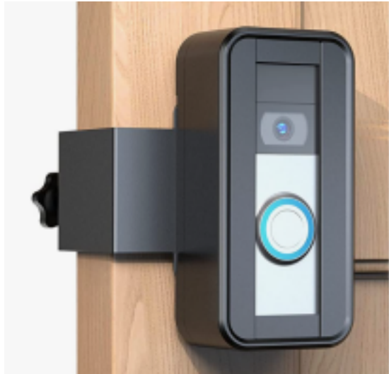
DG-Direct Anti-Theft Video Doorbell Mount, No Drill Doorbell Mount For Apartment Door Renters Home Office, Fit For Most Kind Of Video Doorbell - - Amazon.com