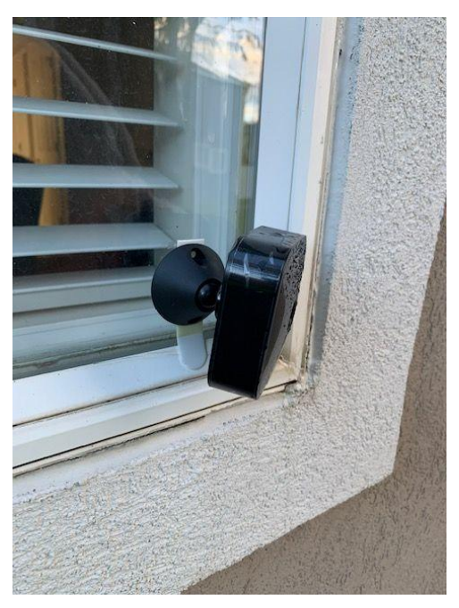
Command strip adhesive

Here are examples of proper security camera installation.